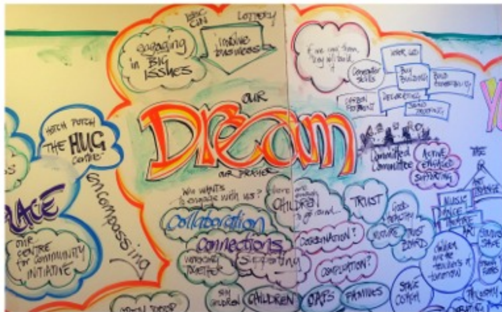
Detail from "Vision Day" illustrated by Tim Casswell of Creative Connections